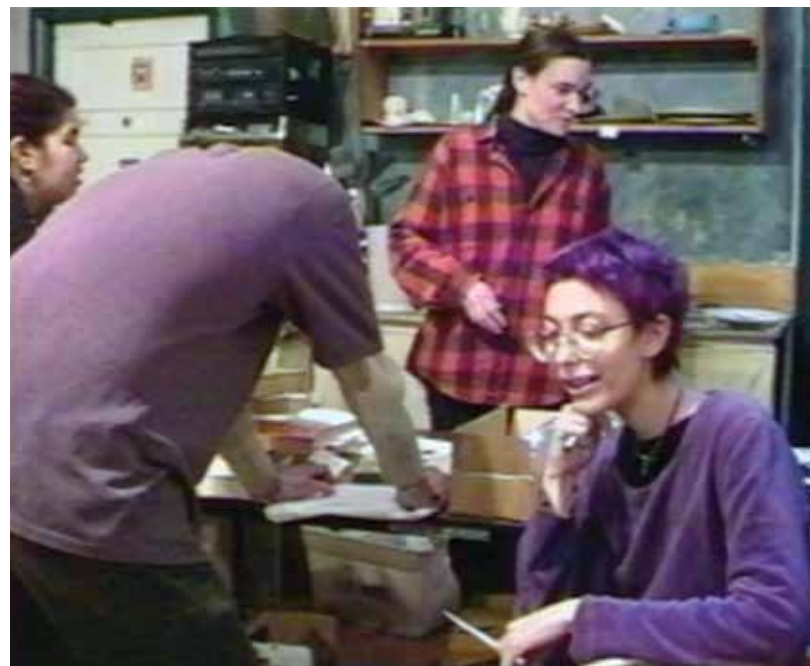
► Books Through Bars 1997

A Cop Watcher's Story: El Grito de Sunset Park Attempts to Deter Police Brutality (Steve de Sève, Brooklyn Information and Culture TV [BRIC TV], Copwatch Brooklyn, 2017, 6 minutes)