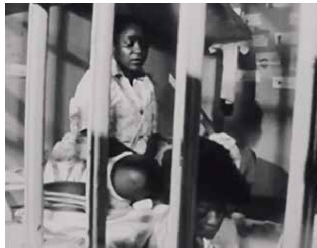
► Inside Women Inside 1978

Based primarily in Appalachia, the Old Regular Baptist Church is one of the oldest religious denominations in the area, and is a unique product of Appalachian culture. In the Good Old Fashioned Way captures the spirit and faith of the congregants of the Old Regular Baptist Church and the impact of their religion on their lives. The film documents an association meeting, church music, foot-washing ceremonies, memorial services at a family cemetery, and a riverside total immersion baptism. DISTRIBUTOR: APPALSHOP