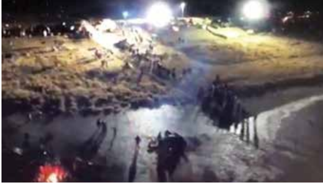
► Digital Smoke Signals: Aerial Footage from the Night of November 20, 2016 at Standing Rock 2016