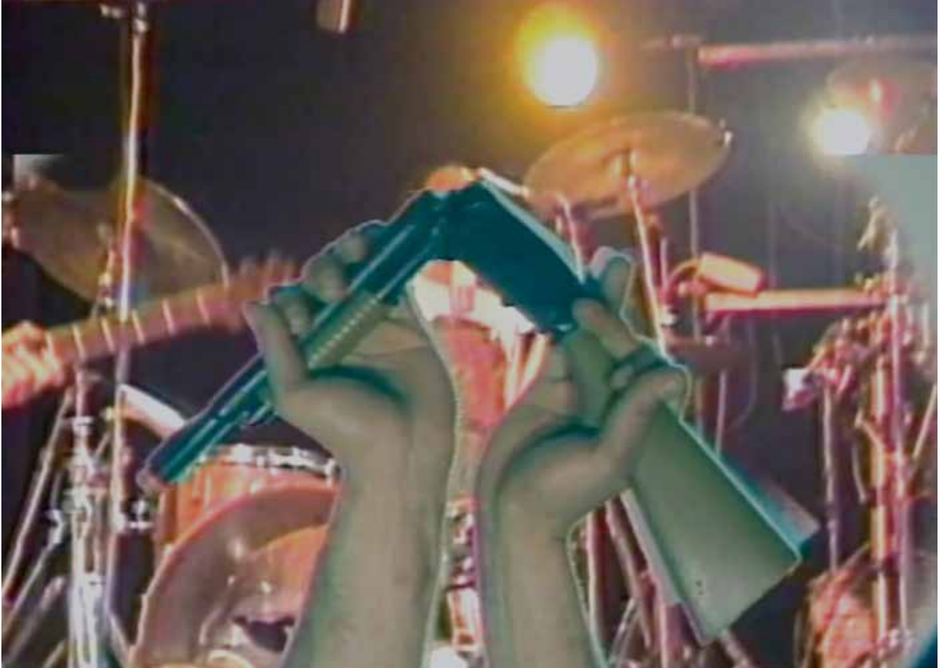
► Just Say No: The Gulf Crisis TV Project #55 1990