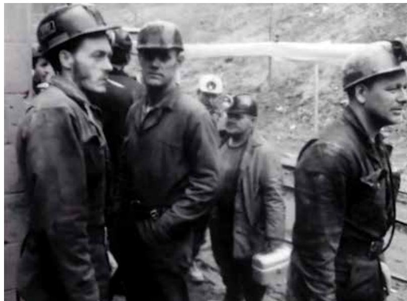
► The United Mine Workers of America 1970: A House Divided 1971