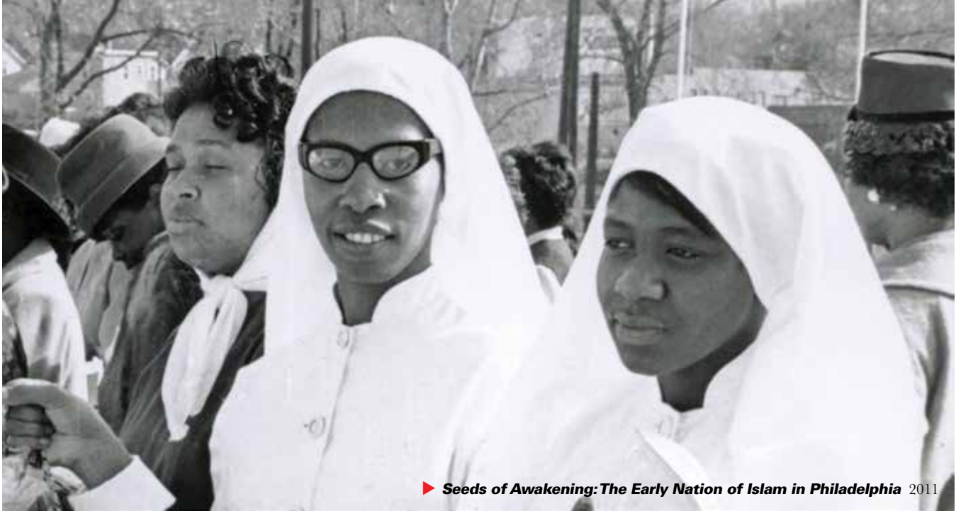
► Seeds of Awakening: The Early Nation of Islam in Philadelphia 2011