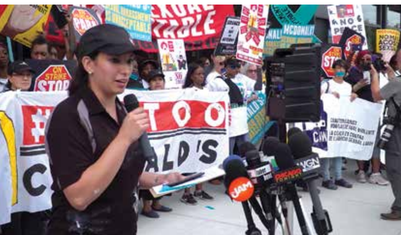
► I'm NOT on the Menu 2018