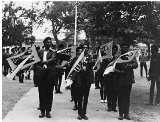
► Black Panther a.k.a. Off the Pig (Newsreel #19) 1967