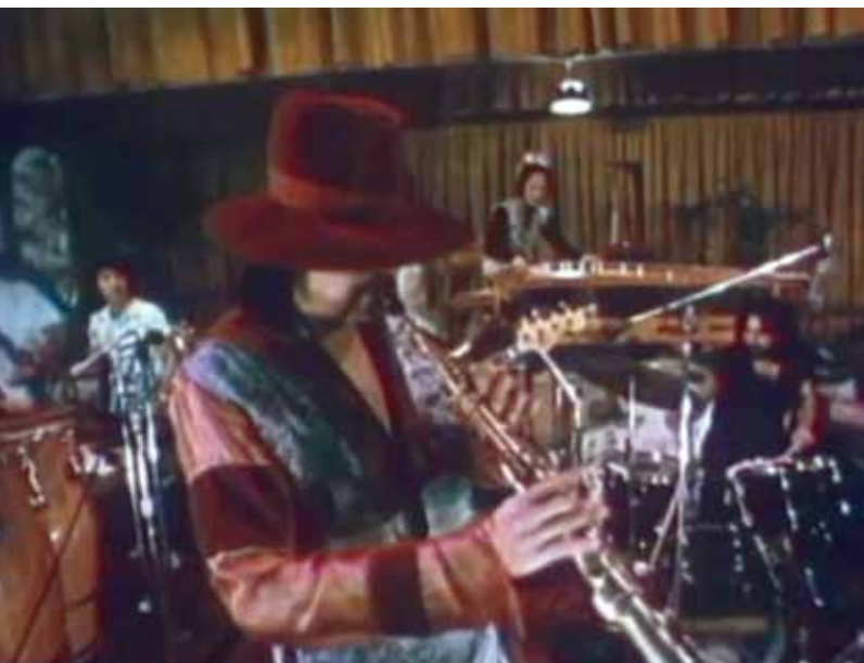
▶ Cruisin' J-Town 1974

Digital Smoke Signals Aerial Footage From The Night of November 20, 2016 at Standing Rock (Myron Dewey, Digital Smoke Signals, 2016, 7 minutes) A, B